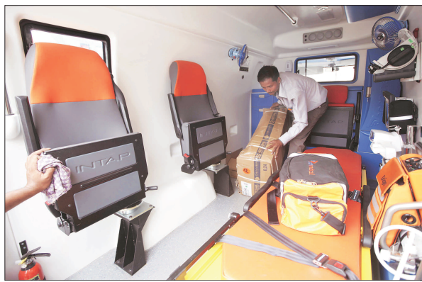
(Top) As many as 26 ICUs on wheels were launched for civil hospitals in the state. (Above) Workers arrange instruments inside the hi-tech vehicles before dispatching them to the hospitals.

Dr Bimal Modi, Orthopedic surgeon in Gandhinagar Civil Hospital explained in